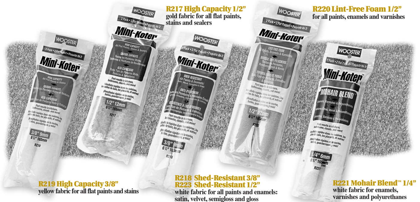
R219 High Capacity 3/8" yellow fabric for all flat paints and stains

Wooster Mini-Koter products are as all-American as baseball and apple pie! We make them here with the same attention to quality as our standard 9-inch rollers and frames. The “foot-long” shanks are great for painting tight areas: behind radiators, pipes, or toilet tanks and other narrow spaces where a brush won’t reach. Trilingual, color-coded bags have headers for better merchandising on peghooks or in wire baskets.